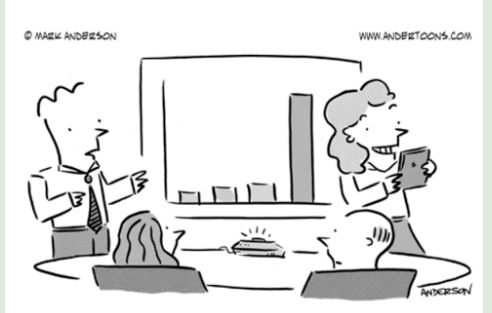
"Before we move on, does anyone else want to take a selfie with the fourth quarter earnings?"