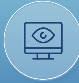
SECURITY AWARENESS TRAINING